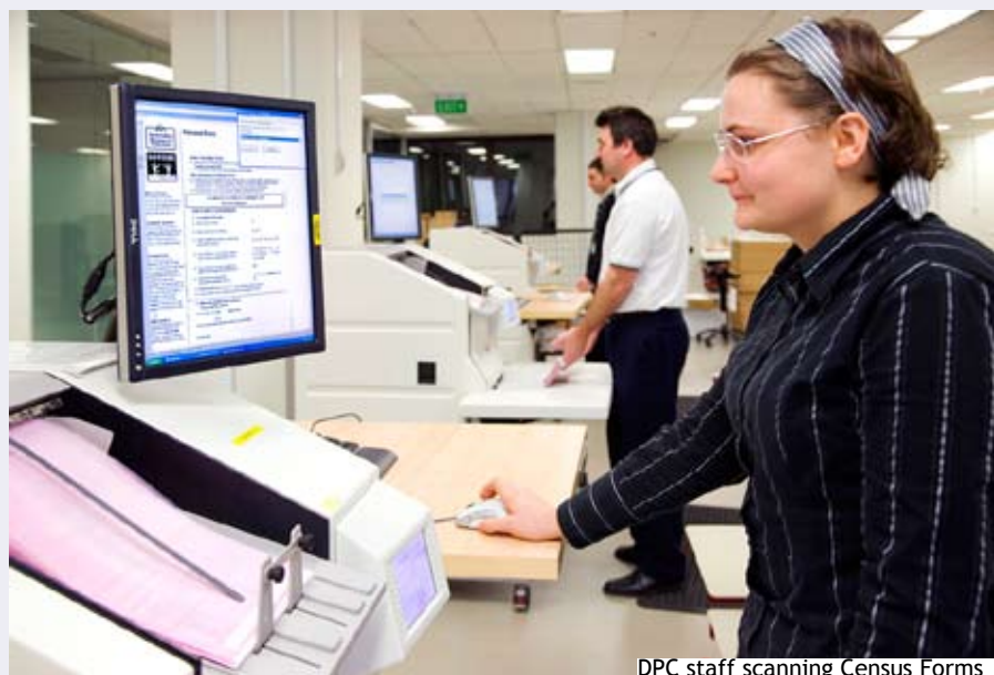
DPC staff scanning Census Forms

The ABS is releasing a new suite of online products to make accessing the 2006 Census data quick and easy. Whatever your data needs